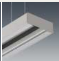
Comfolight® page 6 | 5