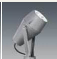
R1 MINI Aluminium chapter 13