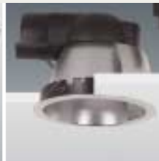
Lunis®E chapter 5