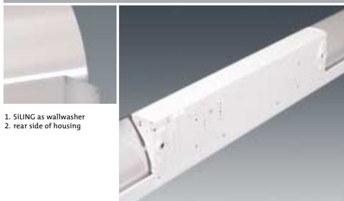
1. SiLING as wallwasher 2. rear side of housing