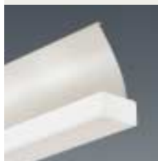
SiLING page 6 | 4