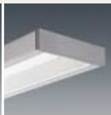
Siteco Louvre Luminaire M page 6 | 6