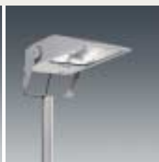
SiCOMPACT A2 MIDI chapter 13