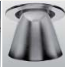
Lunis®M chapter 5