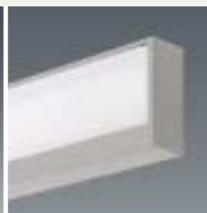
Ceilingwasher page 6 | 7

for floodlighting and accent lighting we also recommend: