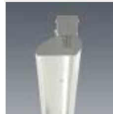
DUS® Plus chapter 7