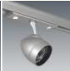
DUS® Plus chapter 7