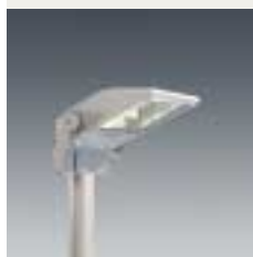
SiCOMPACT A2 MINI chapter 13