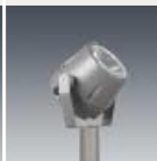
R1 MINI-S chapter 13